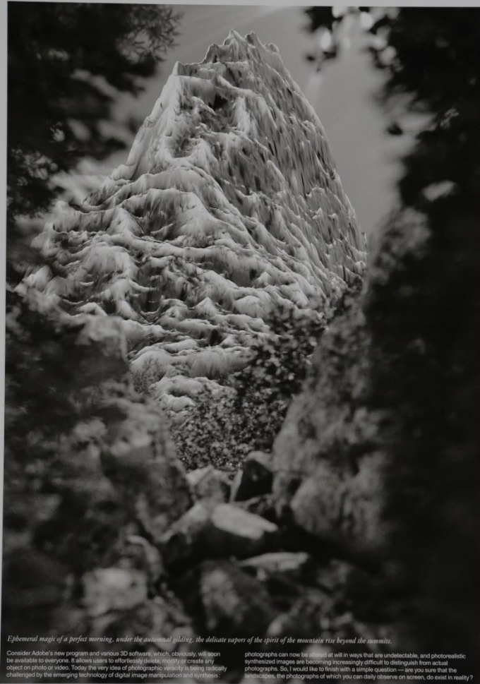
Ephemeral magic of a perfect morning, under the autumnal lighting, the delicate vapors of the spirit of the mountain rise beyond the summit.

Consider Adobe's new program and various 3D software, which, obviously, will soon be available to everyone. It allows users to effortlessly delete, modify or create any object on photo or video. Today the very idea of photographic veracity is being radically challenged by the emerging technology of digital image manipulation and synthesis.