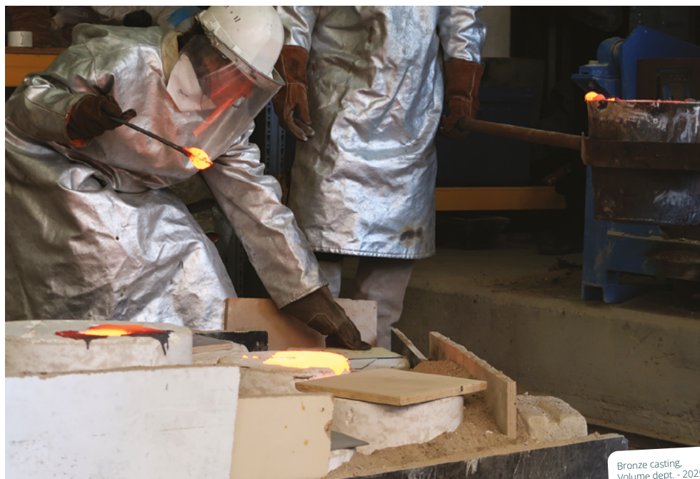
Bronze casting, volume dept. - 2025