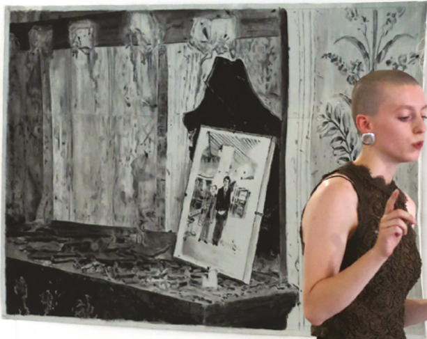
DNA Art, Perrine Dusséaux, 2025