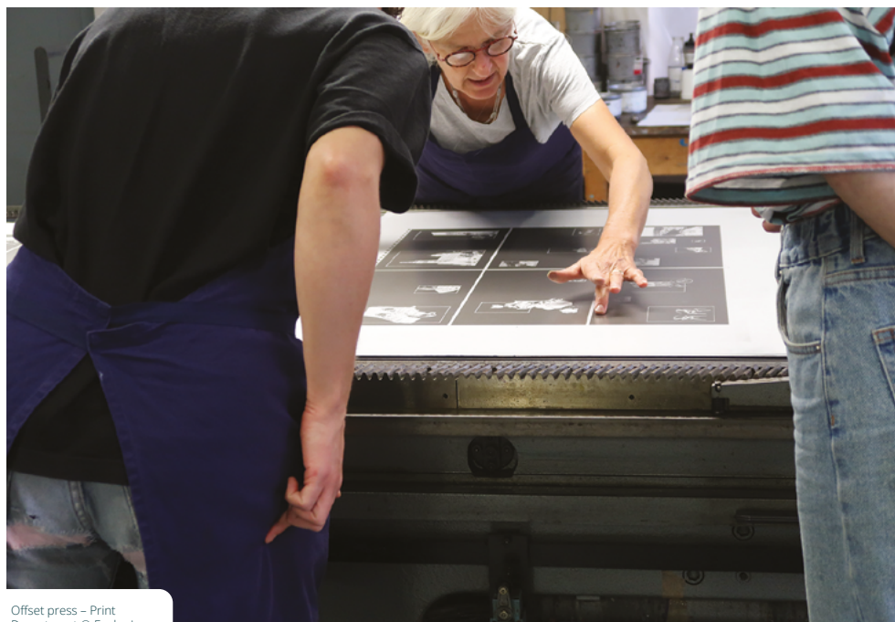
Offset press – Print Department © Ensba Lyon