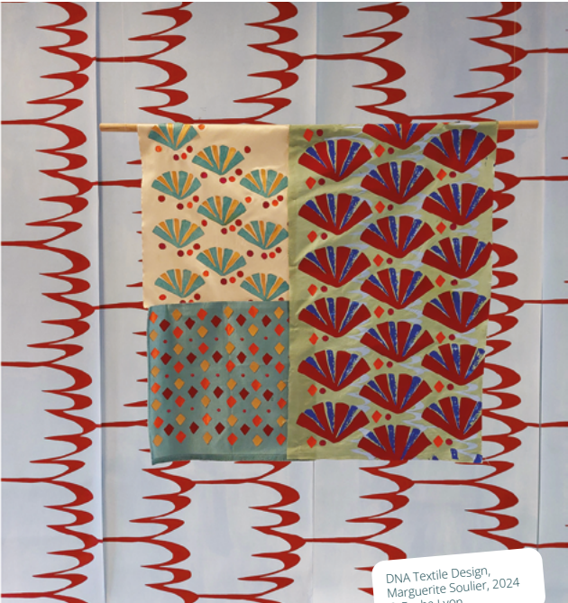
DNA Textile Design, Marguerite Soulier, 2024