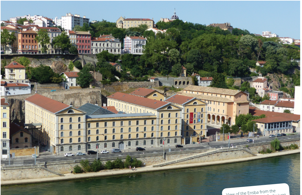
View of the Ensba from the banks of the Saône

The École Nationale Supérieure des Beaux-Arts de Lyon (Ensba Lyon) is a higher art education establishment, certified by the Minister for Culture, hosting around 300 students. It proposes an Art option along with a Design option that has three specializations: Space Design, Graphic Design and Textile Design.