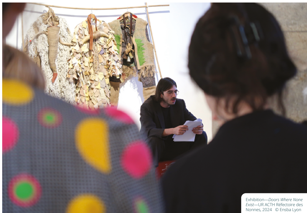
Exhibition— Doors Where None Exist —UR ACTH Réfectoire des Nonnes, 2024

In both art and design, this possibility is offered after the DNA and after the DNSEP to continue with a year of complementary training for professional development: long internships during which the student is accompanied by the establishment.