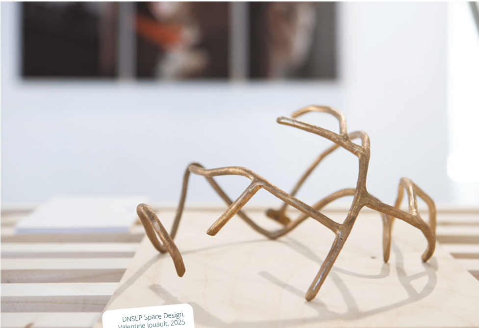
DNSEP Space Design, Valentine Jouault, 2025 © Ensba Lyon