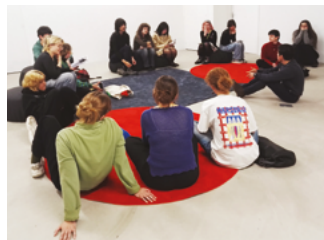
Visit to the CAP St-Fons—2025