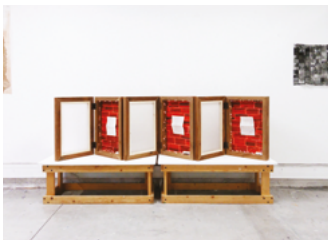
Open Days 2025 © Maité Marra