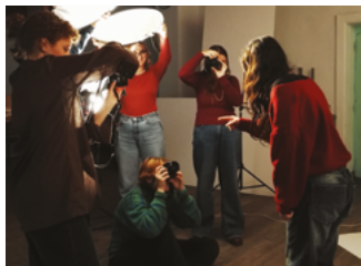
Photography class – Natural Light 2025

On the site of the class prépa, Lyon 69005