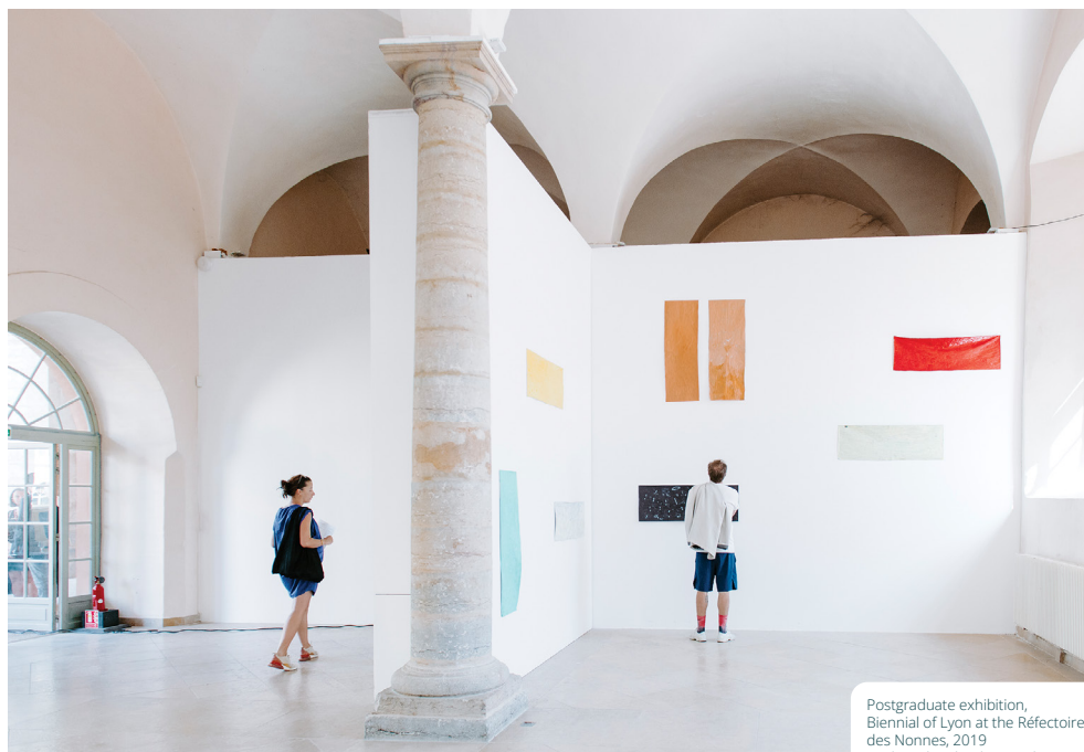
Postgraduate exhibition, Biennial of Lyon at the Réfectoire des Nonnes, 2019

In both art and design, this possibility is offered after the DNA and after the DNSEP to continue with a year of complementary training for professional development: long internships during which the student is accompanied by the establishment.