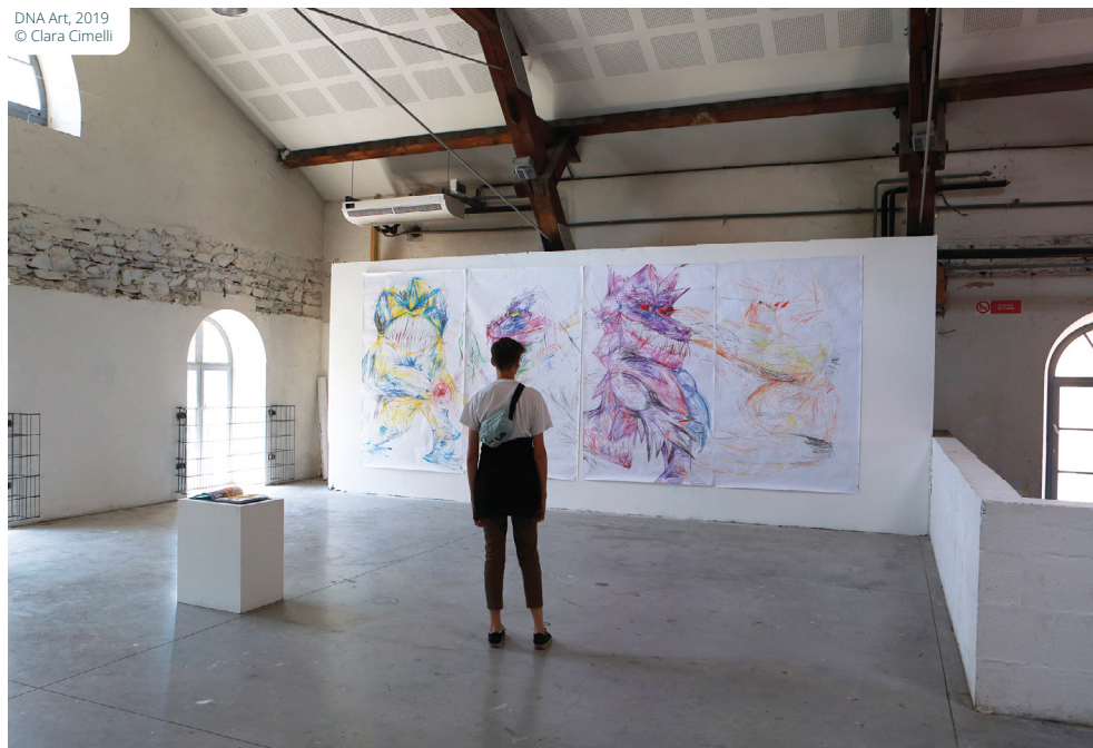
DNA Art, 2019 © Clara Cimelli