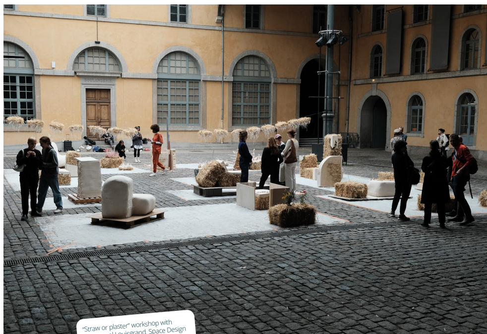
"Straw or plaster" workshop with Emmanuel Louisgrand, Space Design option, 2022