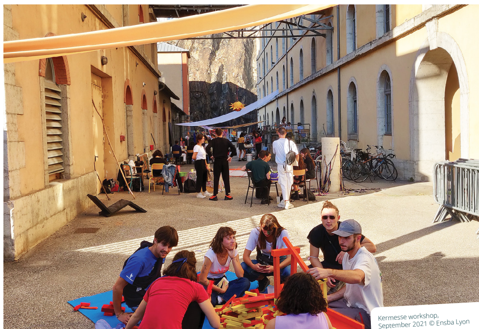
Kermesse workshop, September 2021