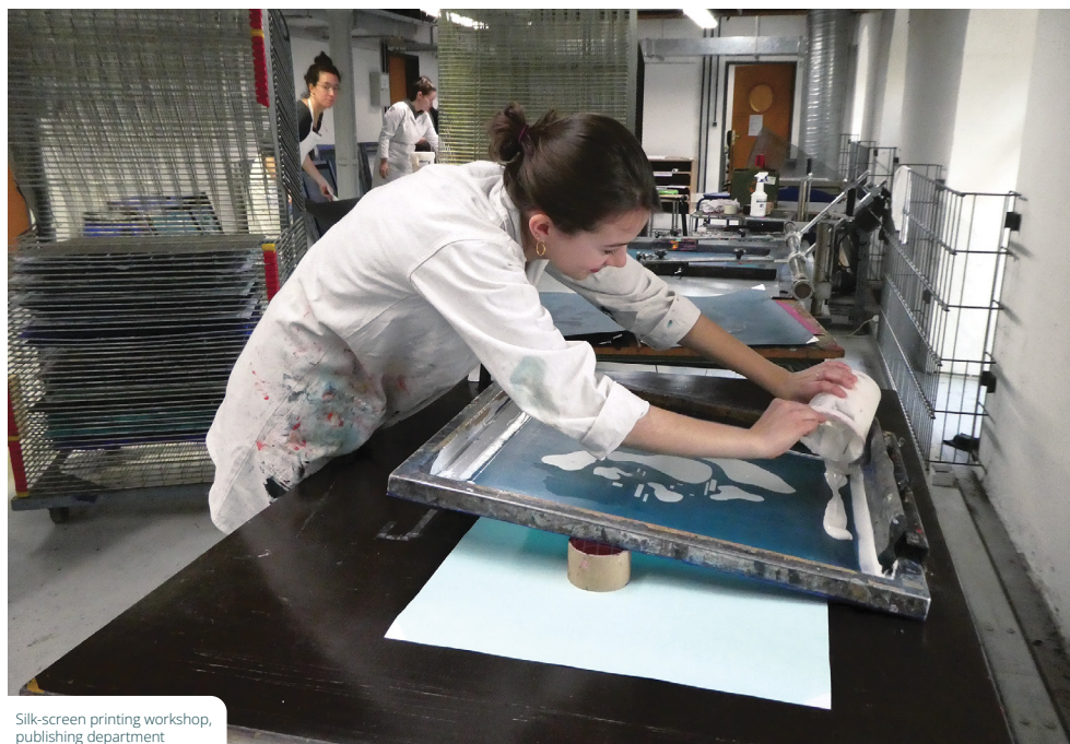
Silk-screen printing workshop, publishing department