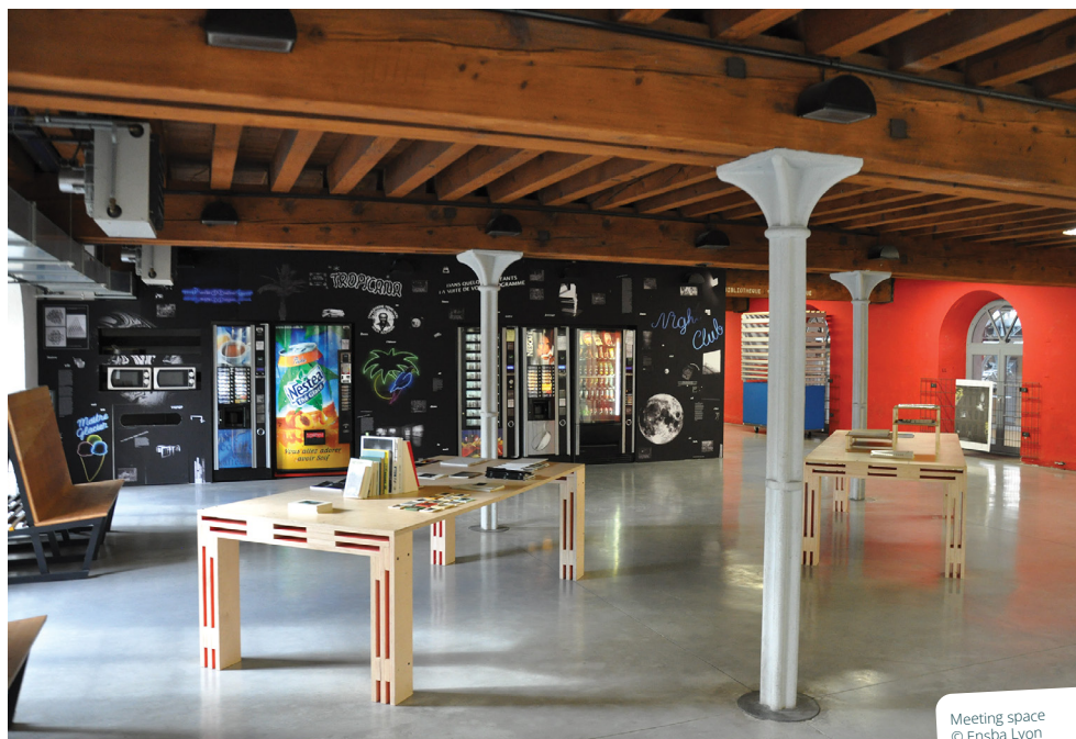
Meeting space