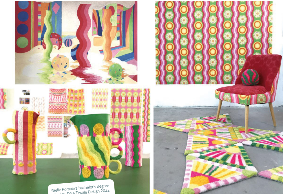
Yaelle Romain's bachelor's degree display, DNA Textile Design 2022 © Ensba Lyon