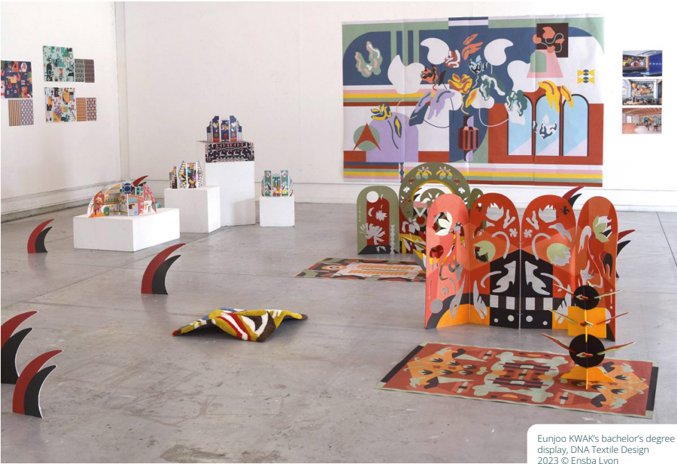
Eunjo KWAQ's bachelor's degree display, DNA Textile Design 2023 © Ensba Lyon